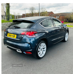
2013 CITROEN DS4 SPORT 2.0 HDI

ONLY 48,000 MILES JUST FULLY SERVICED BY OURSELVES EXCELLENT CONDITION THROUGHOUT GENUINE LOW MILES WILL COME WITH A FULL MOT GREAT VALUE FOR MONEY