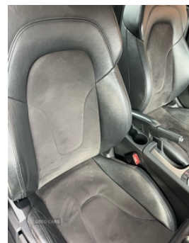
2013 Audi tt coupe sport 1.8 tfsi 6 speed