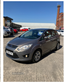
2014 Ford C-Max Zetec Tdci 1.6, 114bhp

86k with a 6 stamp service history, just serviced