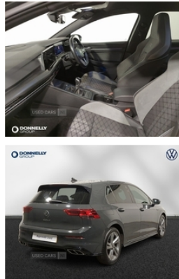
Volkswagen Golf 1.5 TSI R-Line 5dr