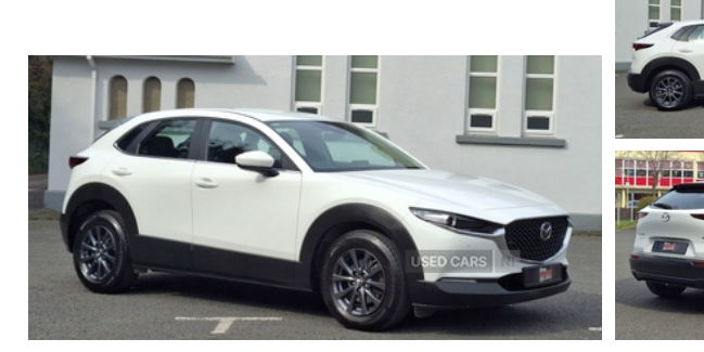
We are happy to offer this beautiful Mazda cx-30 SEL LUX 2.0 e skyactiv MHEV

FULL SERVICE HISTORY/ 15 MONTHS WARRANTY